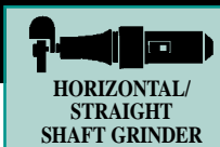
HORIZONTAL/ STRAIGHT SHAFT GRINDER